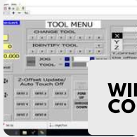
WIN CNC CONTROLLER