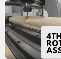
4TH AXIS ROTARY TABLE ASSEMBLY