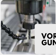
VORTEX AIR GUN