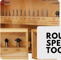
ROUTER SPECIFIC TOOL KITS